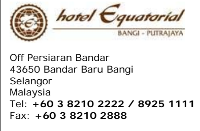
Road Map to Hotel Equatorial Bangi-Putrajaya